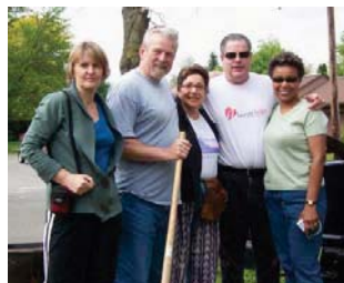
(left) The Washtenaw County Bar Association get to dig in for Gardening with Grace

A wealth of students, both individually and from school groups such as the University of Michigan's Ginsberg Center and Circle K , and Eastern Michigan University tutoring and helping out at our community centers