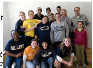
(right) Our furthest traveling volunteer group – students from Rollins college came all the way from Florida to paint at Broadway