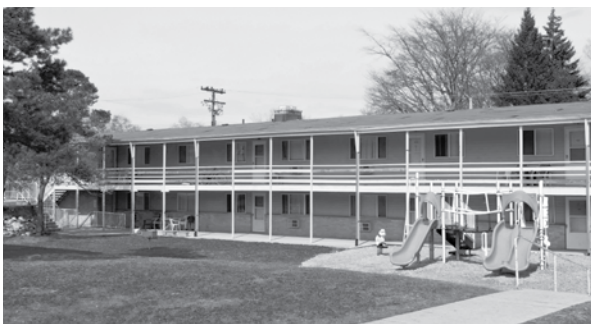
On February 1, 2009, Avalon Housing assumed management responsibilities for 114 WAHC units, including Parkhurst Apartments, (above) at 1500 Pauline Blvd. in Ann Arbor. The last step of the merger process, transferring ownership of WAHC properties to Avalon, should be completed by the end of 2009.

Initiatives Support Corporation have each committed funds to Avalon for costs related to merging operations and housing rehabilitation. Our board merger committee - comprised of Avalon board and staff members, and key volunteers - has spent countless hours pouring over work plans, budgets, legal documents, and staffing changes. We've tapped into the experience of outside consultants and received support from WAHC investors, their board and partner agencies. Volunteers and donors have responded in record numbers as well. Despite the economic downturn, Avalon experienced an increase in giving last year and our volunteer list is growing by the day. Inquiries for volunteer positions have increased by more than 100%.