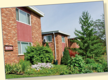
Arbordale Apartments, Ann Arbor

Real estate development in the Ann Arbor area is a tough business for nonprofits—which is why new units on the horizon are so exciting! In 2015 Avalon signed purchase agreements on 12 existing units, and on a parcel of land that will allow us to build up to 70 new permanently affordable apartments. We look forward to providing more info as plans develop.